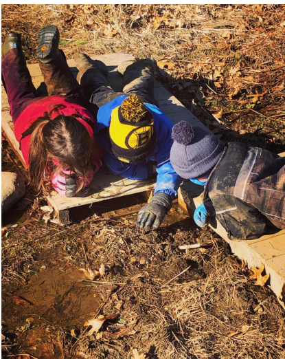
It's mud season! Here at Acorn we say BRING IT ON! Here are some of our afternoon preschool Woolly Bears just watching the water under the bridge.