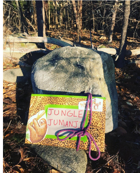
The 4 year old preschoolers are deep into their rainforest habitat learning unit! Last week they engaged in a TimberNook invitation to Jungle Jumanji!