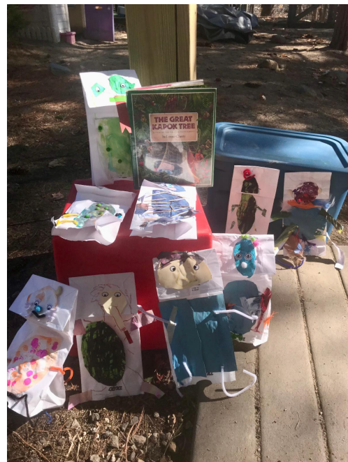
The great Kapok tree puppets by the Chickadees.